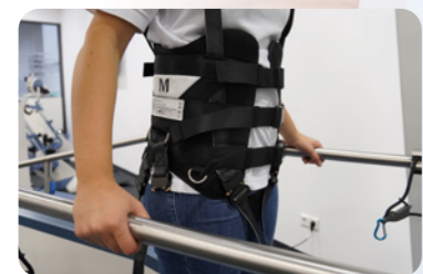
New comfortable patient harness system with multiple connection points and innovative aging indicator

„The focus today is on providing very active therapy that is close to everyday life. Many studies have shown a clear dose-response relationship. This means that exercise should not only be highly targeted, but also as intensive as possible. This is especially true for rehabilitation aimed at restoring patients' ability to walk.“